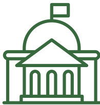
Figure 2. Calls to Action for Partners in Improving Efficacy of Client-Centered Obesity Care

Support laws that lower barriers to proper obesity care, like the Medical Nutrition Therapy Act and the Treat and Reduce Obesity Act.